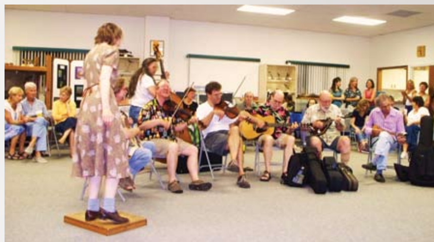
FROM TOP: FUN RUN AT TROUT LAKE DANCE DEMONSTRATION FOR LAKE EUSTIS FOLK MUSIC SOCIETY