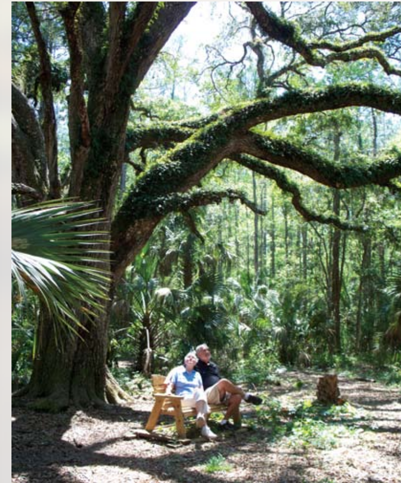
LET'S MEET UNDER THE GRANDFATHER OAK