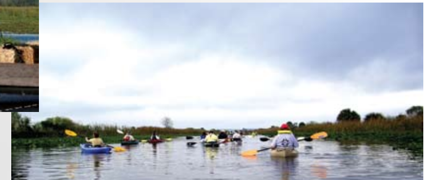
CLOCKWISE FROM TOP: TURTLE PADDLE JOE BRANHAM AT BUGG SPRING PADDLE AT EMERALDAL MARSH BIRDS & BICYCLES, EMERALDAL MARSH STARGAZING AT LAKE NORRIS