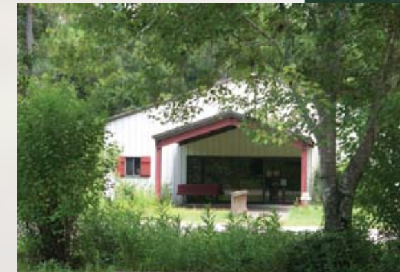
CLOCKWISE FROM TOP: WELCOME ARCHITECT'S RENDERING OF PROPOSED TEACHING MUSEUM & AQUATICS LAB ENVIRONMENTAL EDUCATION BUILDING PADDLE AT BLACKWATER CREEK BOARDWALK AND DOCK ON TROUT LAKE INSIDE THE CURRENT MUSEUM