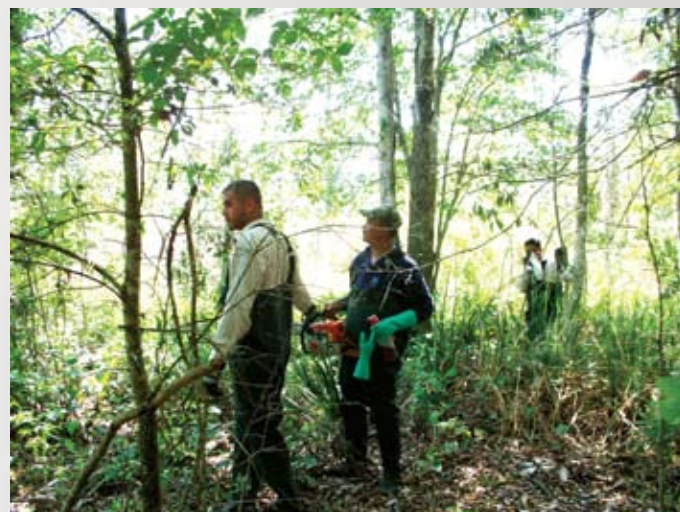
CLOCKWISE FROM TOP: CASSIA COWPOKES EUSTIS HIGH STUDENT'S TALLOW TROPHIES REMOVING CHINESE TALLOW LSCC STUDENTS LEARN FIRST HAND WORK CREW