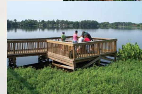
FROM TOP: NEW HASELTON TRAIL ENTRANCE INVERTEBRATES ARE COOL LET'S EAT AT FRIDAY NIGHT NATURALIST

Our volunteers donated 9,342 hours at Trout Lake Nature Center last year... another new record